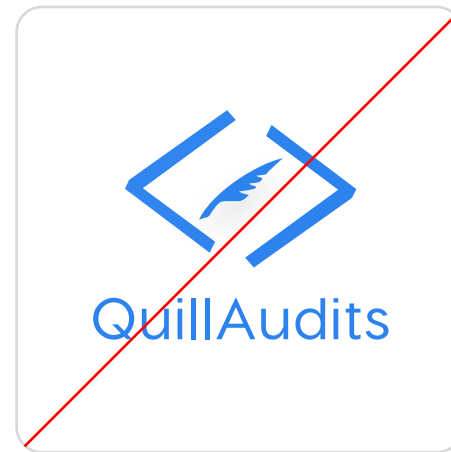
Don't distort the logo