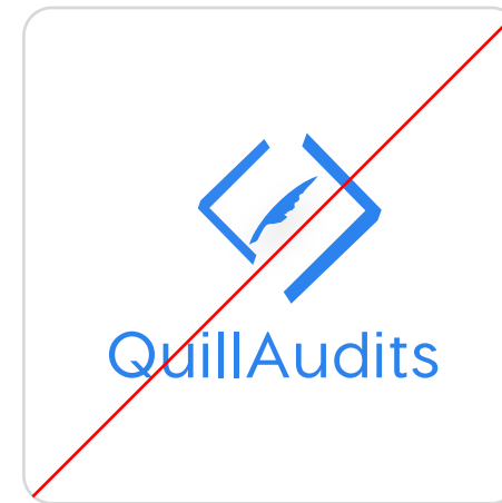
Don't redraw the logo

It is important that the QuillAudits logo and wordmark appear in a consistent manner. Please use one of the variations we provide, and never redraw or re-color the logo or the wordmark.