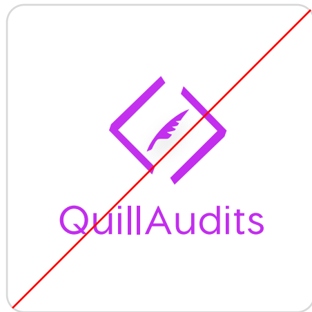
Don't recolor the logo