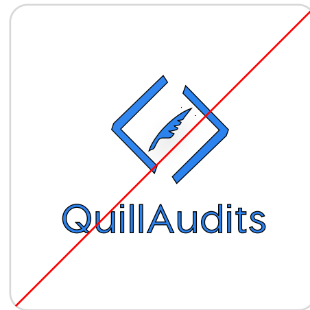
Don't outline the logo